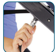
Figure 8 Labeled ② Set Angle right on the equipment!