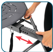
Figure 7 Labeled ① Set Height right on the equipment!