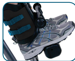
Figure 10 CORRECT