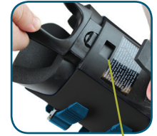
Figure 2A Calf Loop Slot