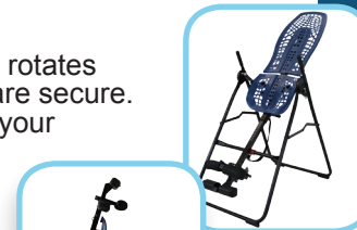
Bed rotated for adjusting the Roller Hinge Setting

IMPORTANT: Set the Roller Hinges in the same hole setting on each side. Refer to Adjustments: Changing the Roller Hinge Setting in the assembly instructions.