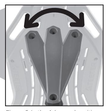
Figure 6: In the Advanced position, the cushion has the freedom to angle left or right to target larger areas between your shoulder blades.